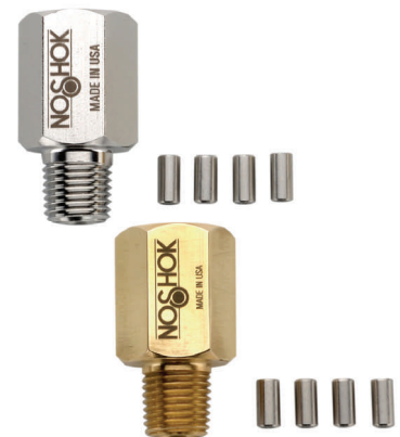
Piston Type Snubbers

Link to Hi-Res Image Click for more info