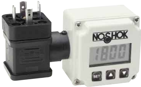
Unit with relay option shown.