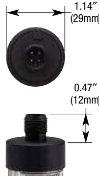
*M12 x 1 *Note: (mate supplied separately or customer supplied)