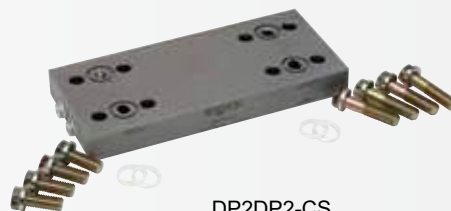
DP2DP2-CS \Delta Pressure to \Delta Pressure Adaptor