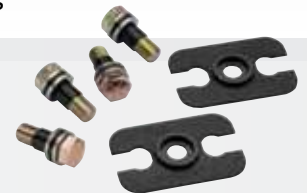
DK1 Dielectric Kit