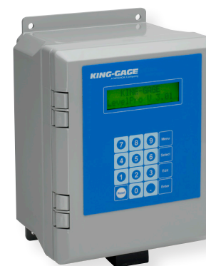
KING-GAGE LP2 MULTIPLE TANK LEVEL INDICATOR

LP3 system provides continuous real-time measurement of level in service or ballast tanks and vessel draft. Tanks are graphically displayed on the screen and include a simple bargraph icon to convey tank level status at a glance. This tank liquid level measurement display package includes signal conditioning, data acquisition and network communications link(s) that can simplify the integration of tank level into a ballast control or vessel management system.