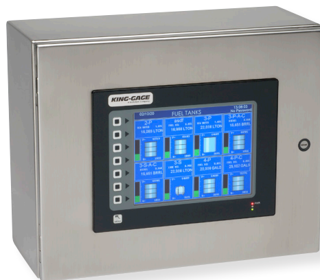
KING-GAGE LP3 MULTIPLE TANK LEVEL DISPLAY SYSTEM